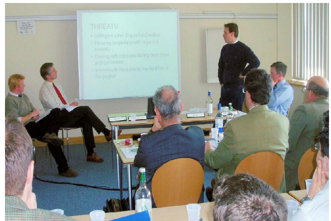
A JET team exercise last year.....Spot the wise men

More details on page 2, in the leaflet or on the website