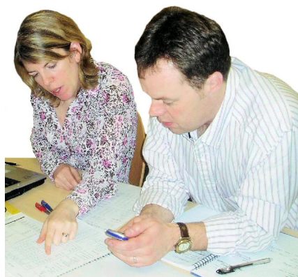
In syndicate, In Andover

The first week at the Royal Agricultural College, Cirencester was the main theory block of the course and covered topics as varied as leadership, media management and benchmarking to analyse business performance. Tutors and speakers were brought in to lecture to us on this specialist field. We all took it in turn to chair the lectures, which